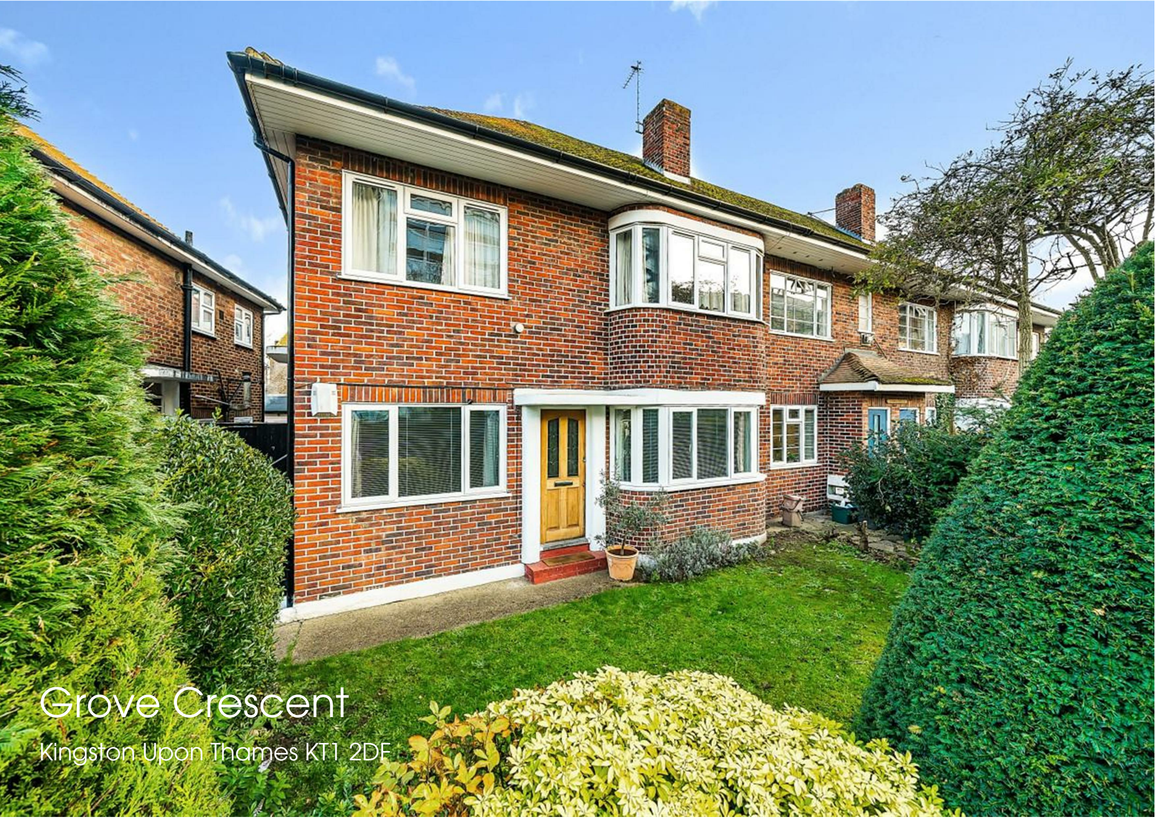
Grove Crescent Kingston Upon Thames KT1 2DF